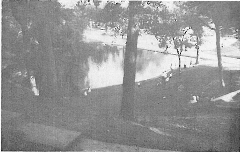
Young people enjoying the beauty of God's creation at Youth Camp.

The summertime air of May brings on spring fever—and Youth Camp fever. It is time to seriously think about going to youth camp. Then take action—send in your registration form to the camp of your choice.